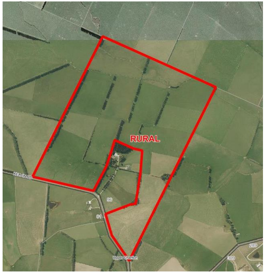
Figure 1: Subject site in red and surrounding areas

This site is not identified as being on the Selected Land Use Register as an actual or potentially contaminated site.