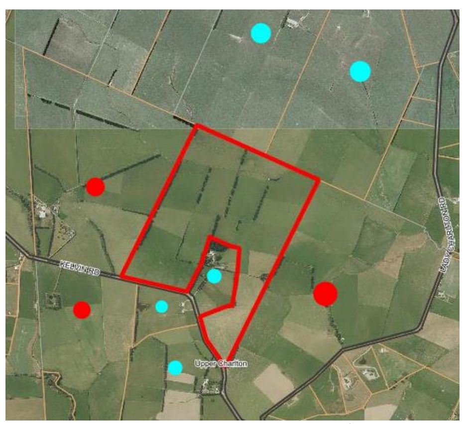
Figure 2: Subject site and neighbouring properties identified by blue dots. Red dots indicate land owned by the applicants.

The adjacent persons assessed are all the owners of the properties that share a common boundary with the subject site or located opposite the subject site. These are indicated by blue dots. The red dots are properties owned and managed by the applicants and therefore adverse effects have been disregarded.