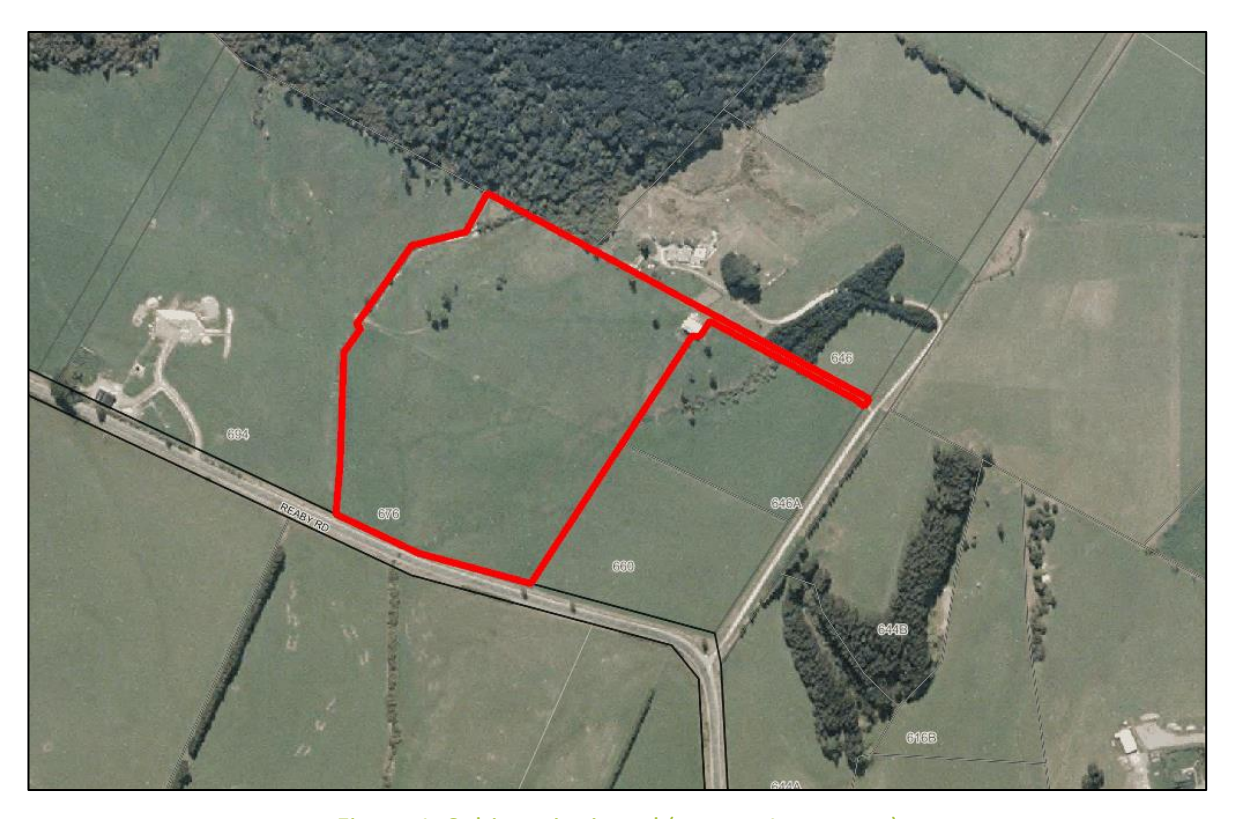
Figure 1: Subject site in red

The site contains an existing dwelling located in approximately the south-west portion of the site and an accessory shed near the end of the access leg.