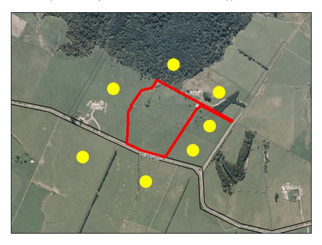
Figure 2: The adjacent properties shown by yellow circles

The adjacent persons who are assessed below are all of the owners of the properties that share a common boundary with the subject site and those that are located opposite the site.