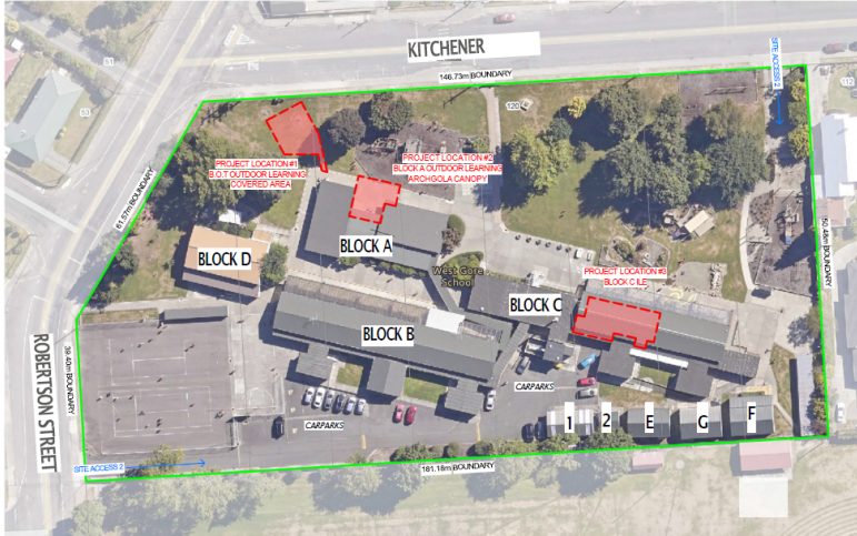
Site Locality Plan

Project name AMS A: Outdoor Learning ILE C: Classroom Upgrade Project address WEST GORE SCHOOL 120 Kitchener Street, Gore Client West Gore School BoT Project number 4050-23-03 Date June 2024 DO NOT SCALE OFF THIS DRAWING CONTRACTOR MUST VERIFY ALL DIMENSIONS ON SITE BEFORE COMMENCING ANY WORK IF THERE ARE ANY DISCREPANCIES IN THE DOCUMENTS PLEASE SEEK CLARIFICATION BEFORE PROCEEDING WITH ANY WORK NO BUILDING WORK SHALL PROCEED UNTIL BUILDING CONSENT HAS BEEN GRANTED FOR THE WORK DESCRIBED COPYRIGHT © CS CONTRACTING Revision notes