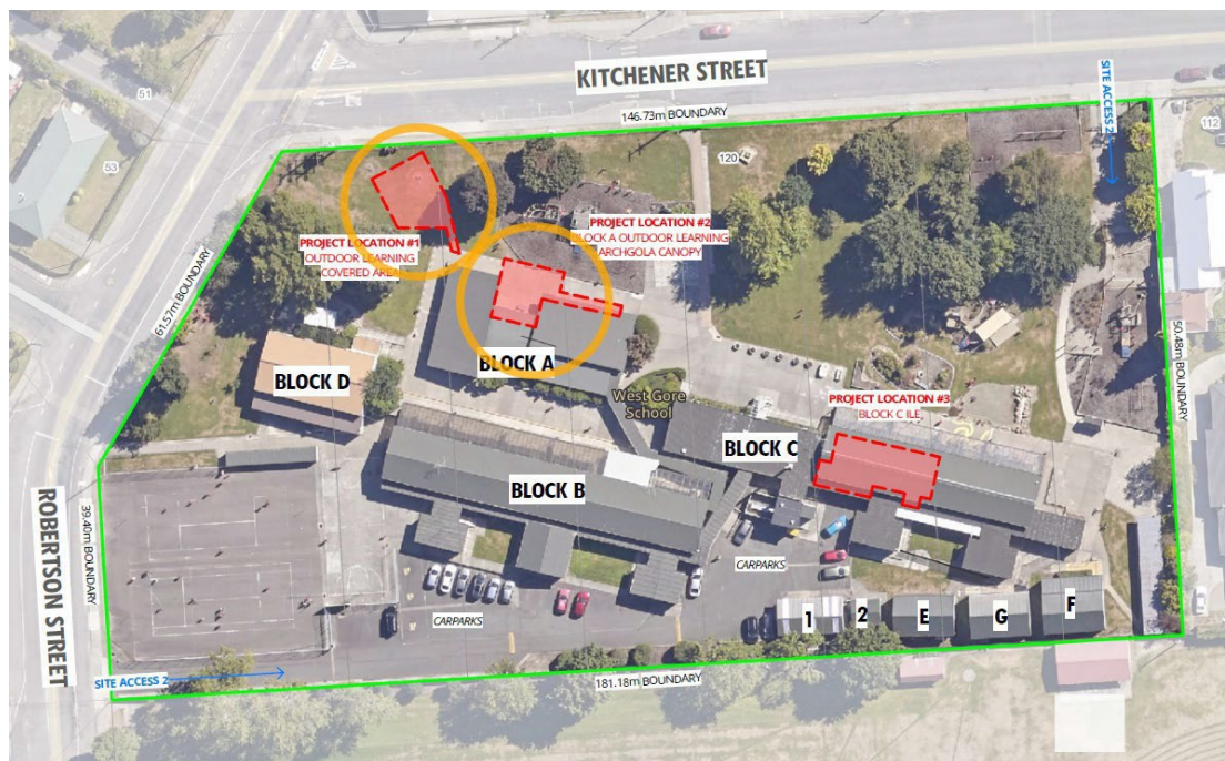
Figure 1: Site plan of the proposed alterations outlined in red (Source: Outline Plan of Works).