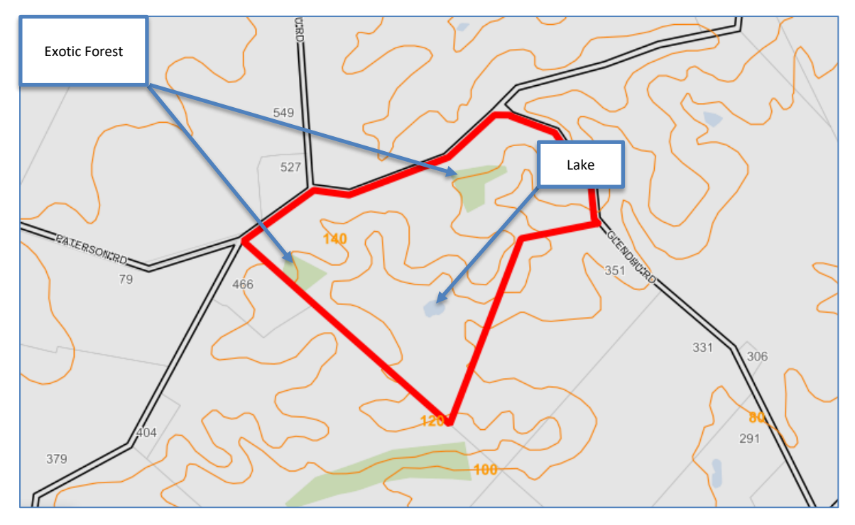
Figure 3: Aerial image showing topography, exotic forests, and lake on site