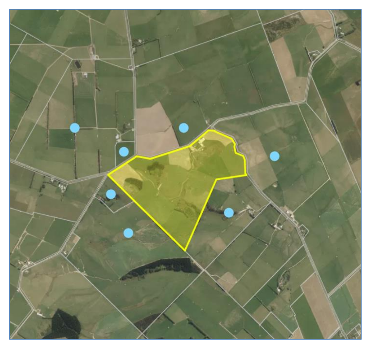
Figure 4: The adjacent properties shown by blue circles

Taking into account the exclusions in sections 95E, the following outlines an assessment as to whether the activity will have or is likely to have adverse effects on persons that are minor or more than minor.