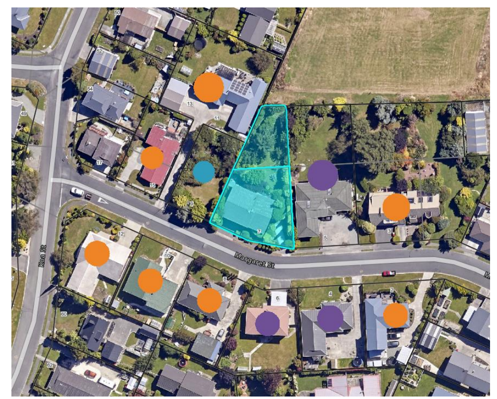
Figure 3: Surrounding neighbours to the subject site. Purple indicates APAs provided by owners of the site, orange indicates adjacent neighbours, and blue indicates applicant's land.

Effects on persons who have provided written approval have not been assessed. As the applicant owns 9 Margaret Street, written approval in inherent, and as such effects on the applicant as the owner of that property also disregarded.