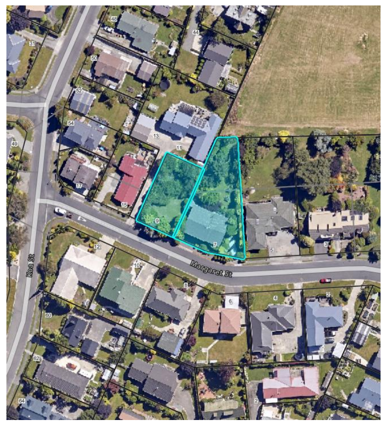
Figure 2: Aerial photo of subject site highlighted in blue

The Council mapping system which sources information from Environment Southland does not identify the site as subject to any risk of flooding and identifies the site's liquefaction risk as negligible. The site is not identified in the Selected Land Use Sites Register ('SLUS') as an actual or potentially contaminated site.