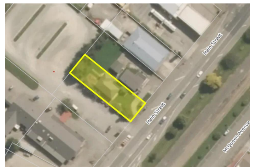
Figure 1: Location of 117 Main Street, Mataura (outlined in yellow)

Figure 1 (below) shows an aerial view of the subject site and its relationship to neighbouring properties.