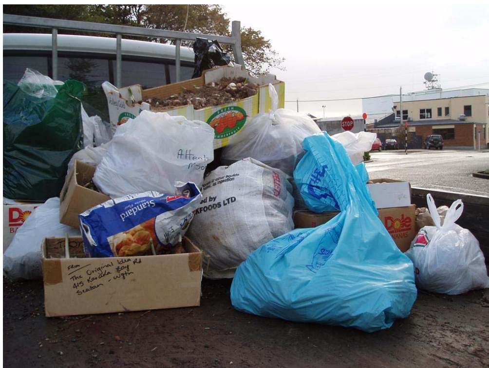
“A truckload of donated bulbs thanks to the generosity of the public”

Most of the Bannerman Park driveway has been resealed and is ready to provide users with a good firm footing when walking through the park. A short section will need to be reconstructed however, as it has been weakened by water getting into the pavement.