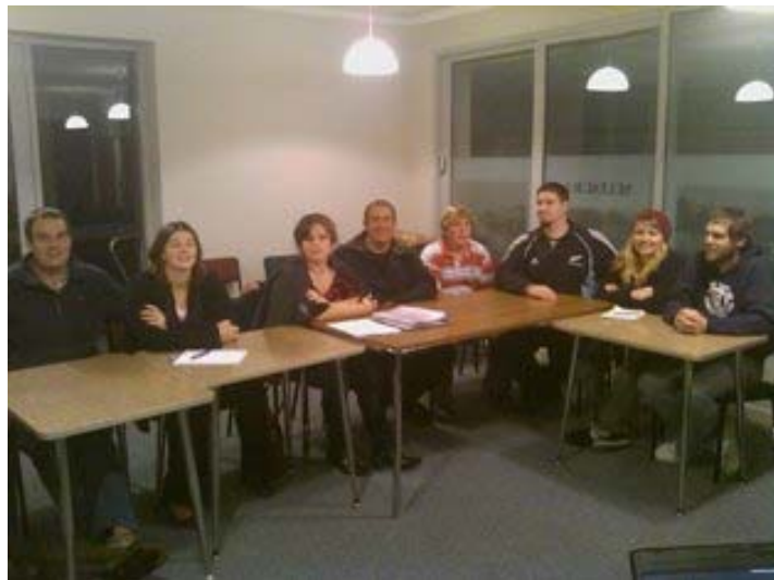
B.E.A.R Programme volunteer training at Mataura Senior Citizens Centre

One Taskforce member, the Mataura Development Trust, along with Gore District Council community development support, continues to gather information via surveys on local business health. Thank you to His Worship and all the volunteers for involving themselves in this process. We are looking forward to the research outcomes from the collated information. It will likely show us the current business health and provide indicators of areas of development potential.