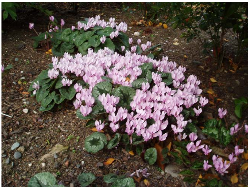
Autumn flowering rockery cyclamen in full bloom

Preparation work is being undertaken on the lower section of the Bannerman Park driveway. The surface has deteriorated rapidly in the last 12 months and upon sweeping preparations, more of the existing seal started to lift. This highlighted a greater issue than first thought. The Council's Roding Manager and staff have formulated a work plan to address the issue prior to the onset of winter.