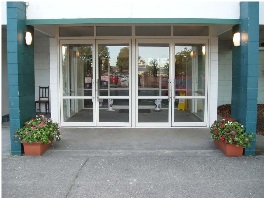
The new electric doors at the James Cumming Wing entrance

Work continues on various building maintenance tasks from the building maintenance schedule. Contractors have undertaken work on the Hamilton Park hall, Dolamore Park buildings, Canning Street flats, water plants and Cemetery buildings.