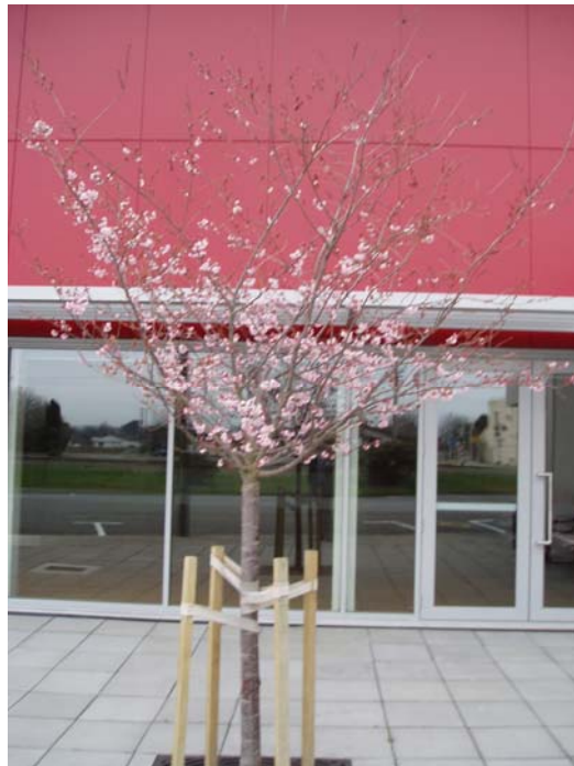
Prunus subhirtella 'Autumnalis' in full flower in front of the Mataura Community Centre

Along with this rise in soil temperature we are noticing some movement in grass growth. As the turf surface is drying out nicely it will allow our mowers to start into their rounds about mid August. This is however tempered by the ground conditions, as some sites are still quite wet and will need to be drier before we can get the mowers onto these areas without leaving unsightly wheel ruts. We are also preparing for an increase in winds over the coming weeks as we move into the spring equinox period.